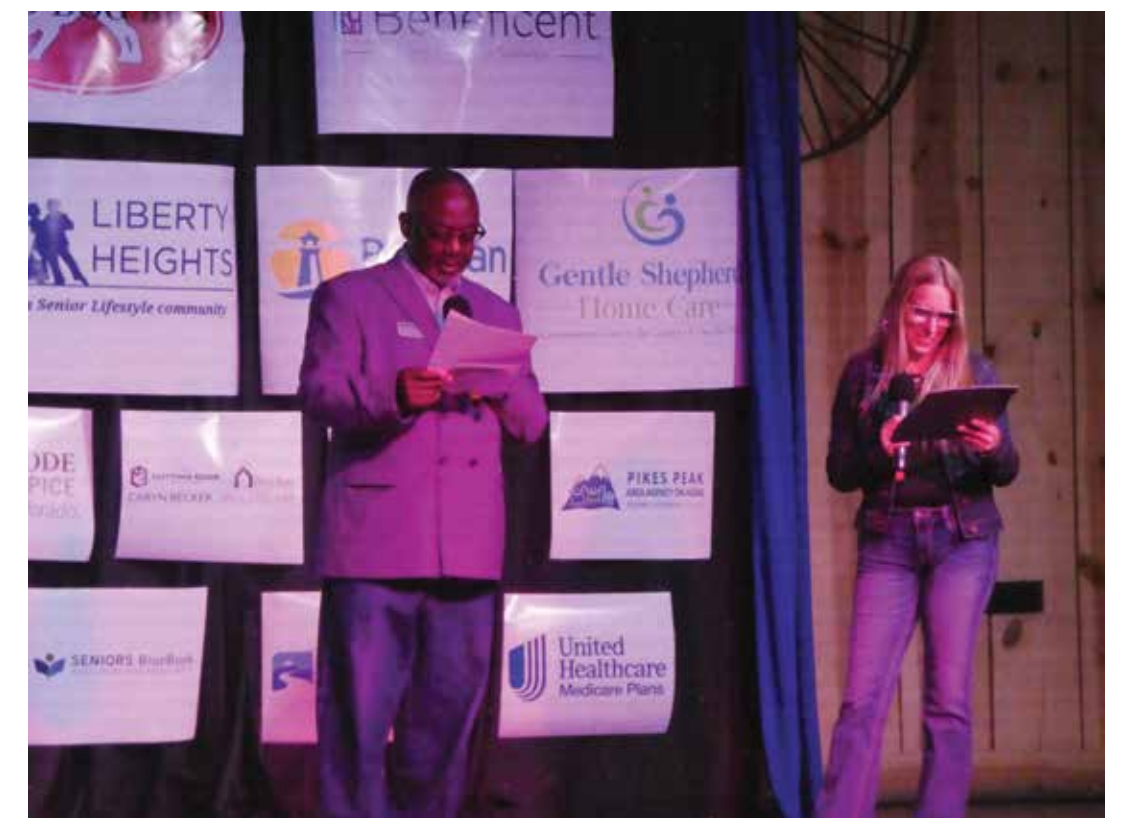
PIKES PEAK SENIOR NEWS · 12

During the year, the Senior Resource Council takes nominations from the public for the best volunteer, professional worker, small business/nonprofit, large business/